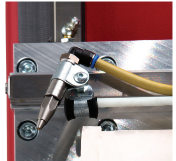
Minimal lubrication system extends tool life without creating a mess

FOR A QUOTE CONTACT YOUR LOCAL ONESOURCE REP OR EMAIL HOMC@1SOURCEDIST.COM