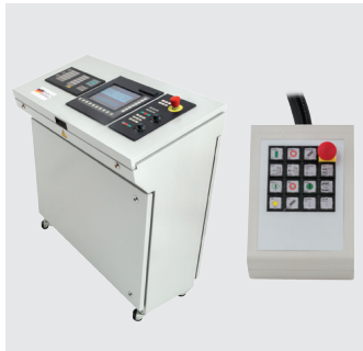
State-of-the-art controls from Beckhoff®